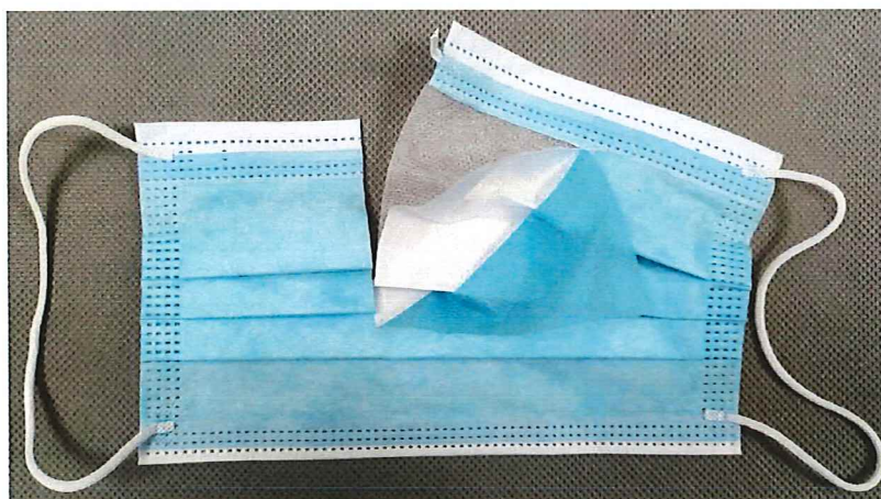
Fig. No.2 – Picture of samples no. 462204056/01

Note: The results given in this Test Report apply only to the sample tested by our laboratory! Without a written consent by Institut pro testování a certifikaci, a.s. Zlín, the Test Report may not be reproduced unless as a whole!